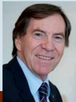
Jean-Claude Mignon, President of PACE

"We all need better human rights, but collective gains come thanks to huge personal dedication and sometimes at the price of personal sacrifice. This work of the civil society needs to be better known and acknowledged and this is what the Prize stands for."