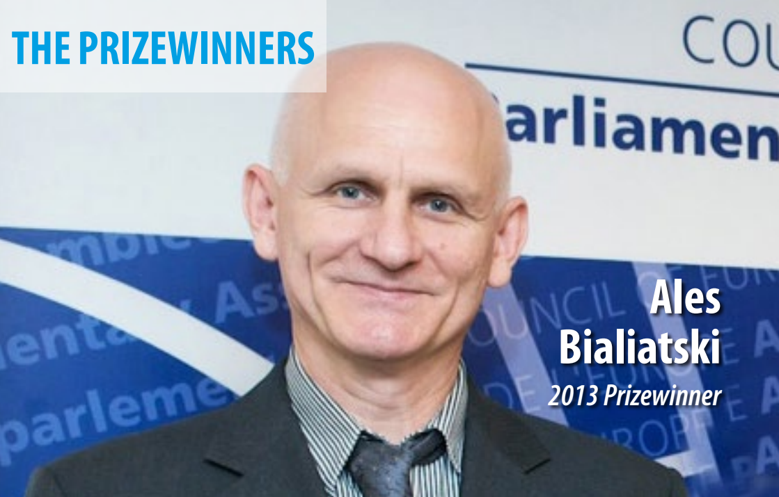
Ales Bialiatski 2013 Prizewinner

O n 30 September 2013, the Prize was awarded to human rights activist Ales Bialiatski (Belarus).